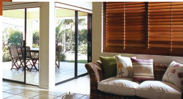
Aluminium Sliding Doors

Sliding windows and doors give you excellent ventilation with an elegant appearance.