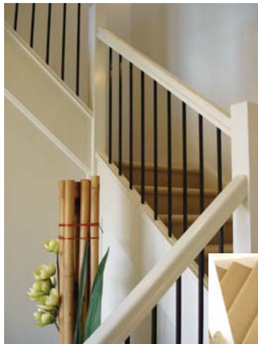
Carpeted Staircase featuring Square Black Balusters with Painted Handrail.