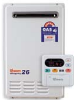
Rheem Integrity 26 Litre with temperature control pads

Compact, energy efficient, continuous hot water with the added benefit of temperature control.