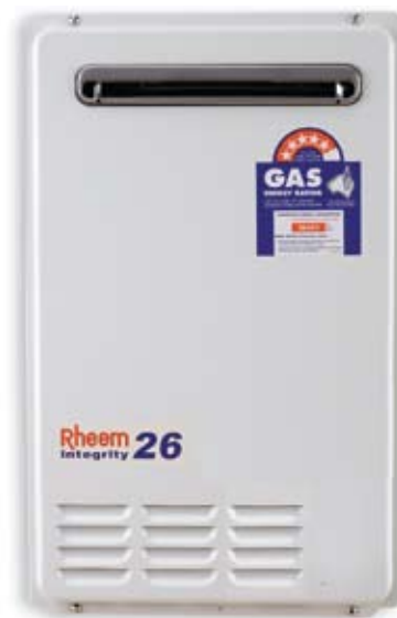
Rheem Integrity 26 Litre

Compact, energy efficient, continuous hot water.