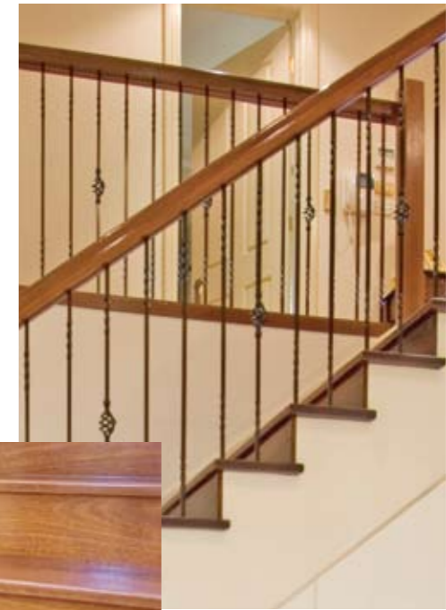
Vic Ash staircase featuring Wrought Iron Balusters with Double Twists and Baskets.

Serving the building industry in South Australia for over 23 years, Top Stairs is one of Adelaide's leading suppliers of staircases, stair kits, balustrading and staircase components.