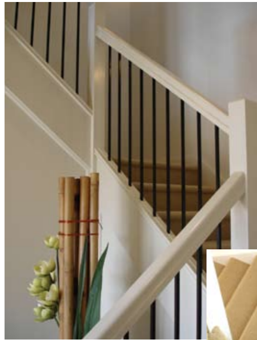
Carpeted Staircase featuring Square Black Balusters with Painted Handrail.